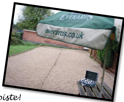
On the piste!

We have three petanque teams during the summer months, but whatever the time of year why not come along and borrow some boules?