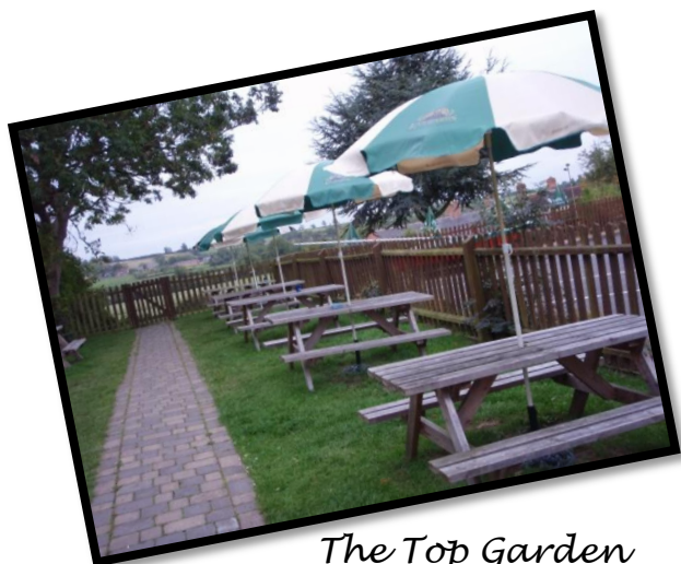
The Top Garden

Please call 01664 434247 for any bookings or enquiries.