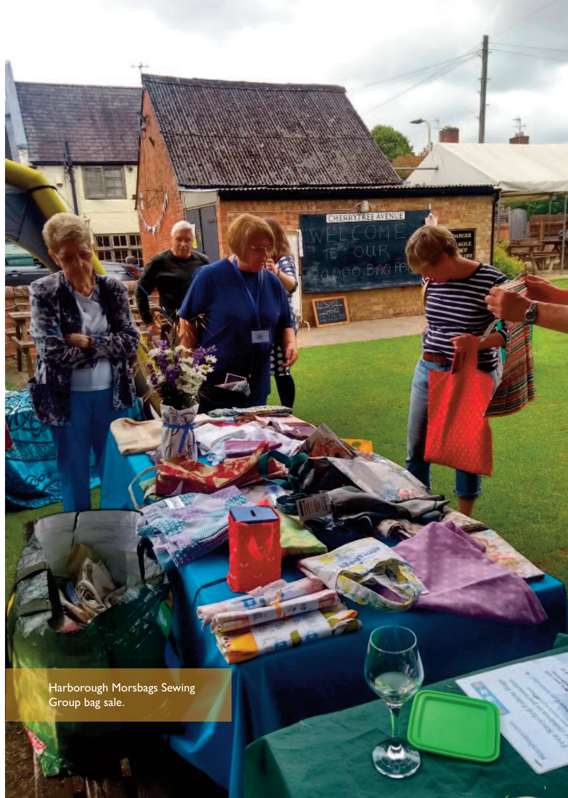
Harborough Morsbags Sewing Group bag sale.

Entries can be made between 14/10/19 – 8/12/19. All entries will be reviewed and shortlisted to a judging panel by the end of January 2020. All applicants will be notified by email if they were successful or not by early February 2020.