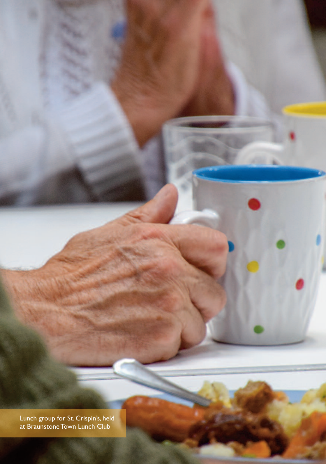
Lunch group for St. Crispin's, held at Braunstone Town Lunch Club